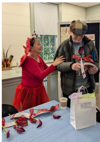
Cupid handing out tickets for the Heartwarming Dinner at Coffee Hour