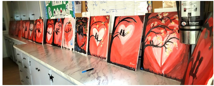
Process vs Product